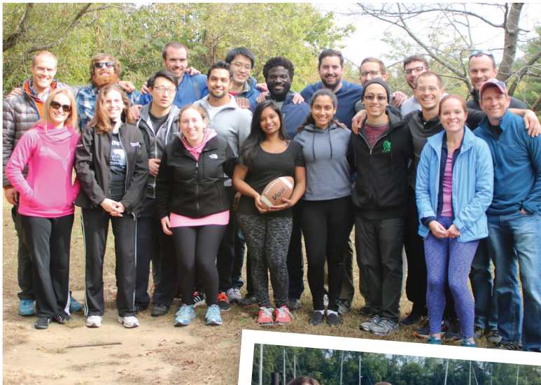
Fun at PGY2 Retreat ▲